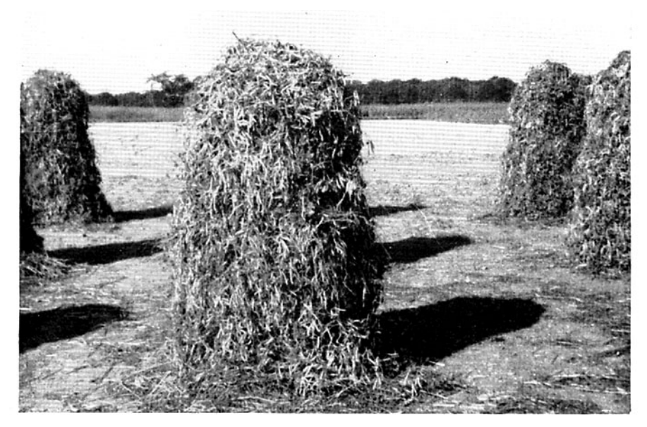
Fig. 13. Well built bean stacks set just off the field to permit timely planting in wheat.