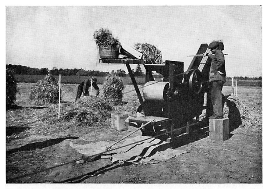
Fig. 3. Threshing small plots of beans. The nine plots of each variety are assembled and stacked in order, a layer of straw keeping each one separate. The beans are allowed to dry in these stacks until they are ready to be threshed.