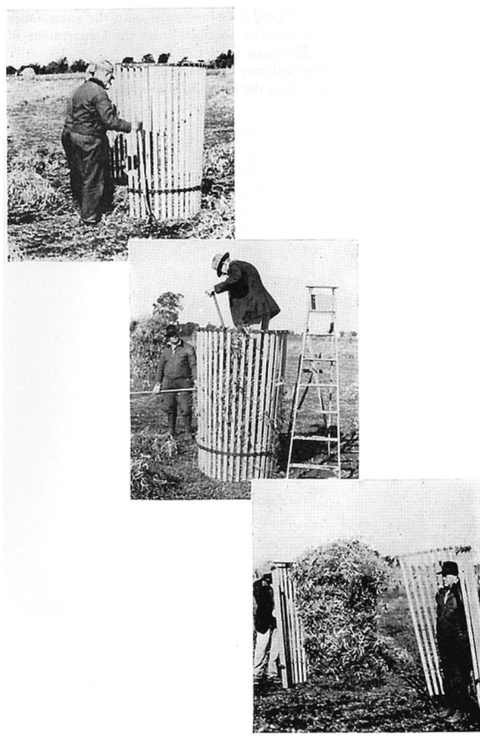
Fig. 14. Building good bean stacks with a form. a — Setting up the form. b — Filling the form with beans. c — Removal of the two sections.

BIRTH PLACE OF ROBUST BEANS The original plant grew in the short rows of beans shown on the Michigan Experiment Station test plats in foreground (1908)